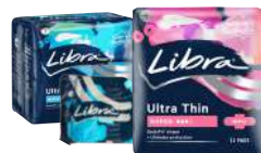
Libra Ultra Thin Regular & Super Pads with Wings