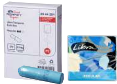
Libra Regular Tampons