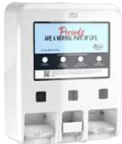
Tork Period Care Dispenser P2