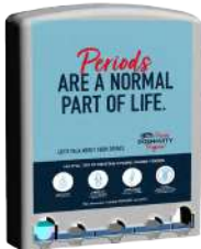
Libra Period Care Dispenser P1