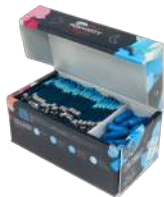
NEW Libra Period Care Box